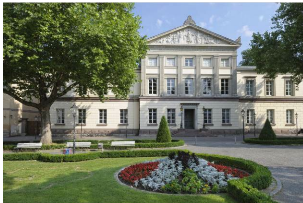
The University

Depending on where students start the Double Degree, they will spend the first academic year at the University of Florence or at the University of Göttingen and the second academic year at the University of Göttingen or at the University of Florence. Master theses comply with the regulations of the university where students spend the second academic year and are recognised by the partner university.