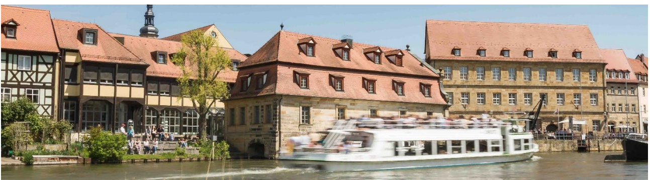
The University

Depending on where students start the Double Degree, they will spend the first academic year at the University of Florence or at the University of Bamberg and the second academic year at the University of Bamberg or at the University of Florence. Master theses comply with the regulations of the university where students spend the second academic year and are recognised by the partner university.