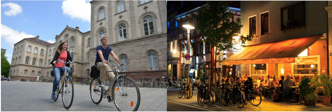
Students and life

After the first academic year in Florence, students spend the entire second year in Göttingen, taking courses from the master's in Development Economics. These courses count towards the degree in the MSc in Economics and Development-Curriculum in Development Economics from the University of Florence. The last semester in Göttingen is dedicated to the completion of the master thesis according to the regulations of the University of Göttingen.