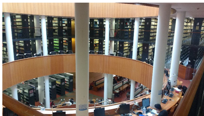
An external and internal overview of the Library of the Social Science Campus.