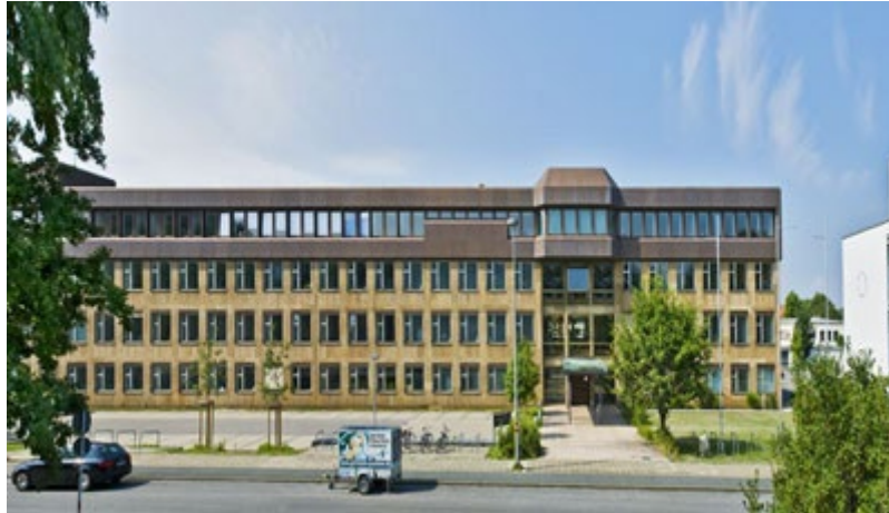
Social Sciences, Economics and Business Administration