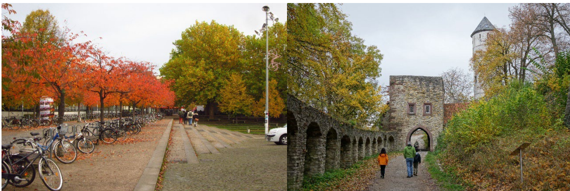
The campus and the city

The opportunities for this program include employment in government and aid agencies working on development issues, international organizations, policy research institutions, international business in multinational companies, and enrolment in a PhD programme.