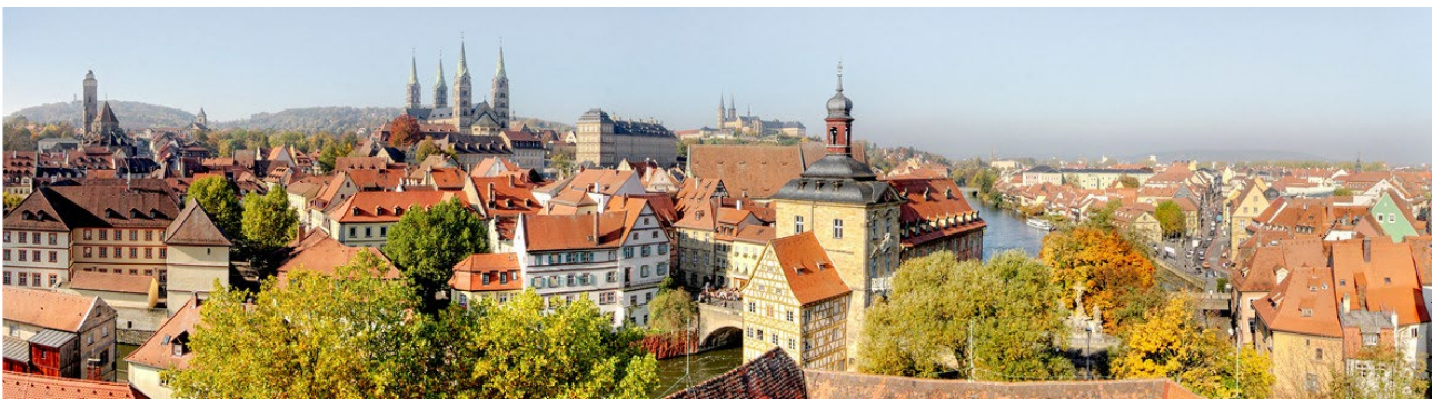
The city

After the first academic year in Florence, students spend the entire second year in Bamberg, taking courses from the master's in European Economic Studies. Here students enjoy a high degree of flexibility and can choose among a variety of courses, both theoretical and applied. These courses count towards the degree in the MSc in Economics and Development-Curriculum in Economics from the University of Florence. The last semester in Bamberg is dedicated to the completion of the master thesis.